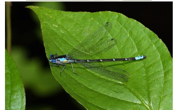
Photos: top, Royal River Cruiser ( Macromia taeniolata), bottom, Aurora Damsel ( Chromagrion conditum)